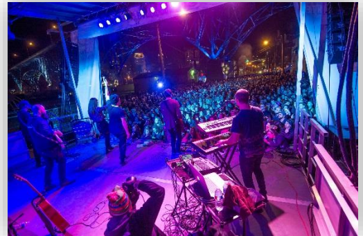
Brite Winter Festival at the Flats.

The purpose of Cuyahoga Arts & Culture's Project Support (PS) grant program is to promote public access and encourage the breadth of arts and cultural programming in our community by supporting Cuyahoga County-based projects. Grant applications are reviewed annually through a public panel review process. In 2018, the grant period will be January 1 – December 31, 2018. CAC will offer two Project Support grant options in 2018. This document provides the guidelines and application instructions for the Project Support I program.