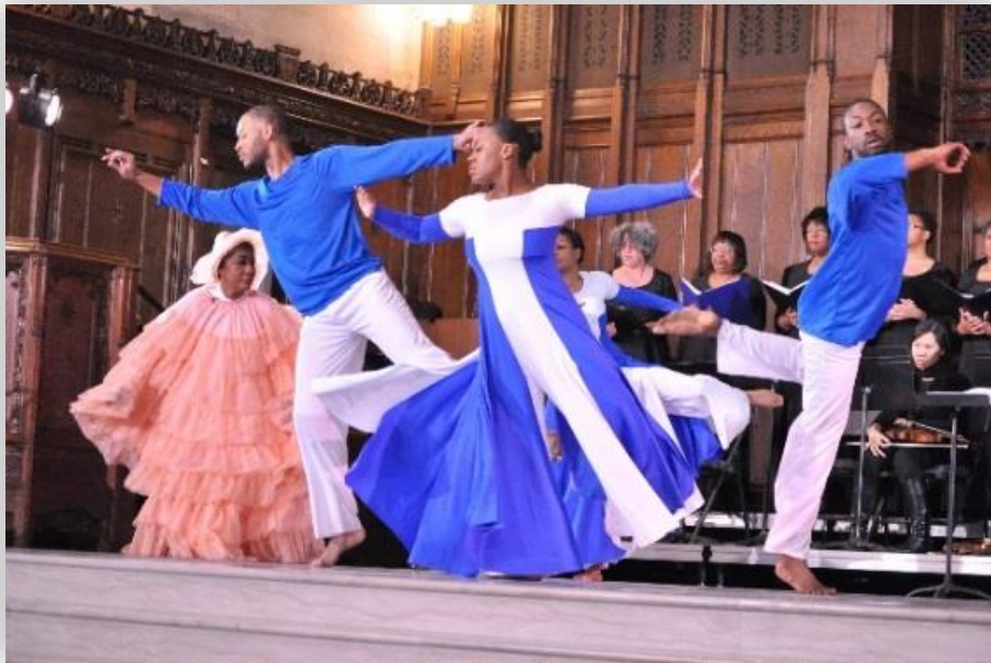
Duffy Liturgical Dance has received a Project Support grant for the past nine years.

A cultural partner not in good standing with CAC will be officially informed of this status in writing.